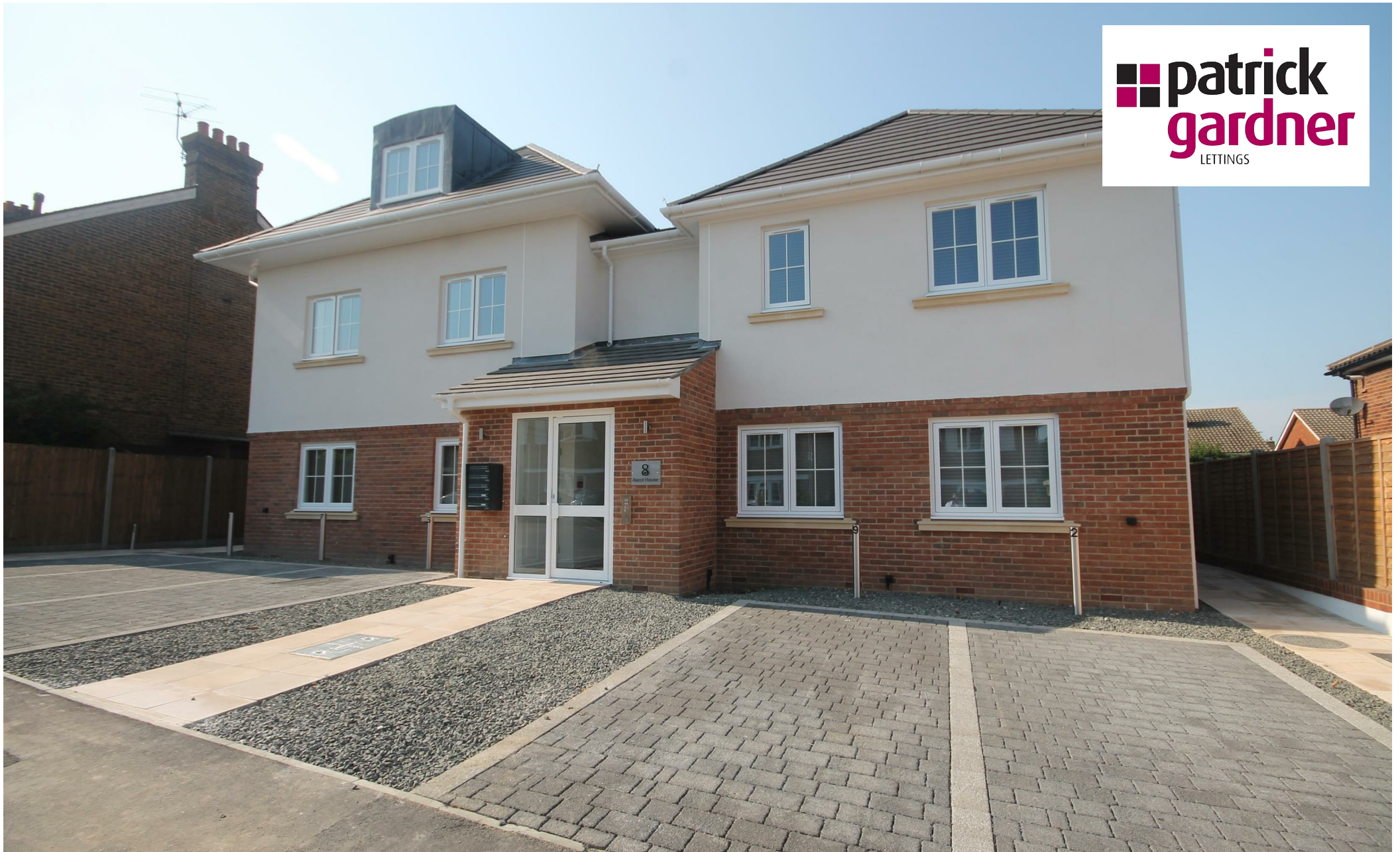
8 Andrews Close, Epsom, KT17 4EX