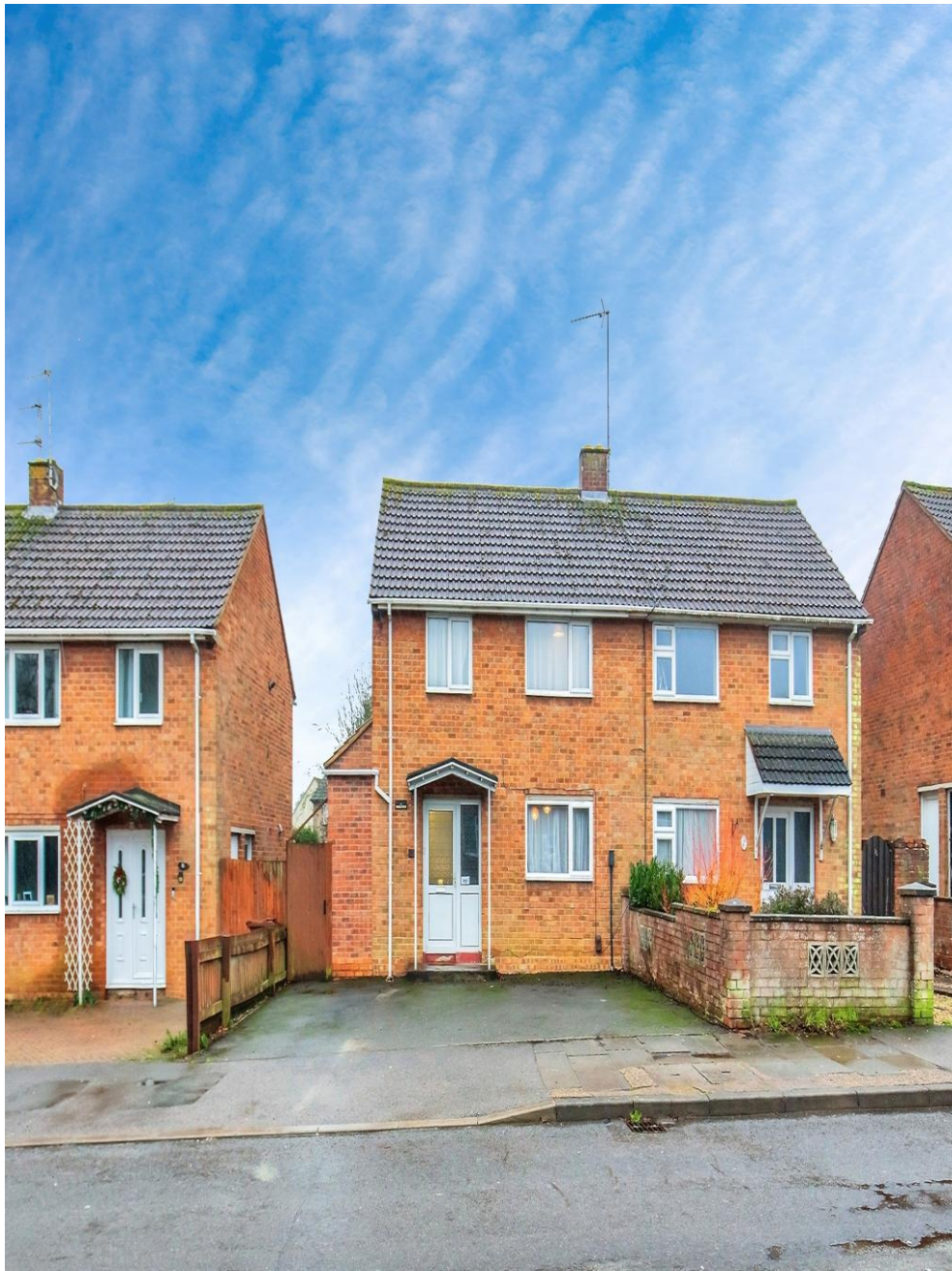
Beanfield Avenue, Corby NN18 0EG