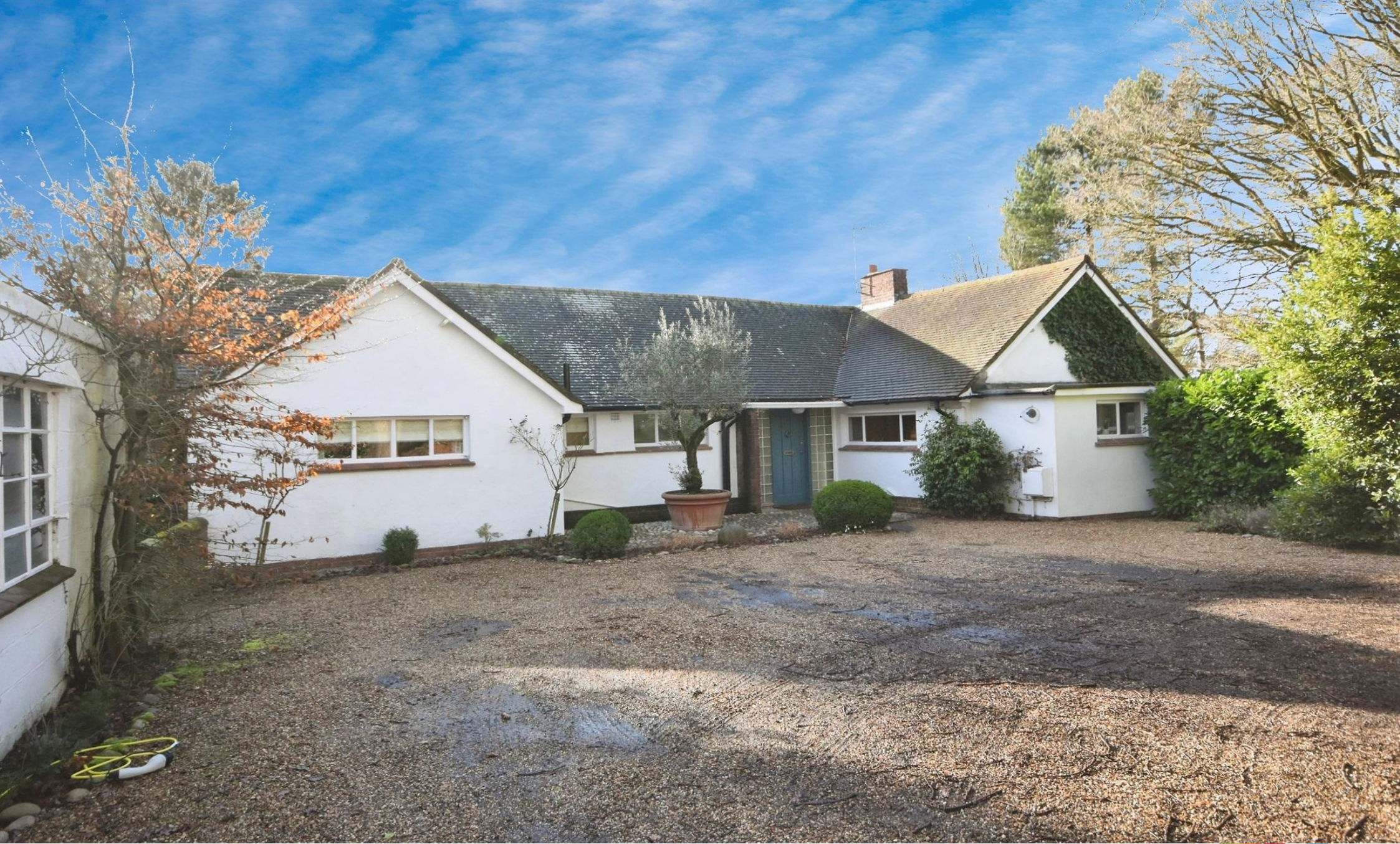
Sky Meadow, Colam Lane, Little Baddow Chelmsford CM3 4SY