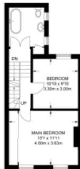
FIRST FLOOR 435 SQ FT / 40.4 SQ M

APPROXIMATE GROSS INTERNAL AREA 1597 SQ FT / 148.3 SQ M