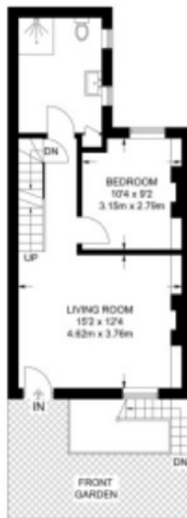
RAISED GROUND FLOOR 436 SQ FT / 40.5 SQ M