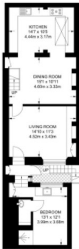
LOWER GROUND FLOOR 686 SQ FT / 63.7 SQ M