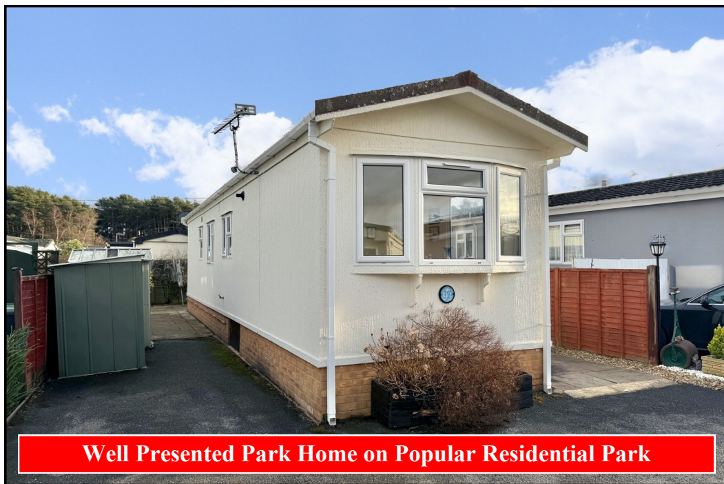
Well Presented Park Home on Popular Residential Park

93 Pinehurst Park, West Moors, Dorset. BH22 0BP