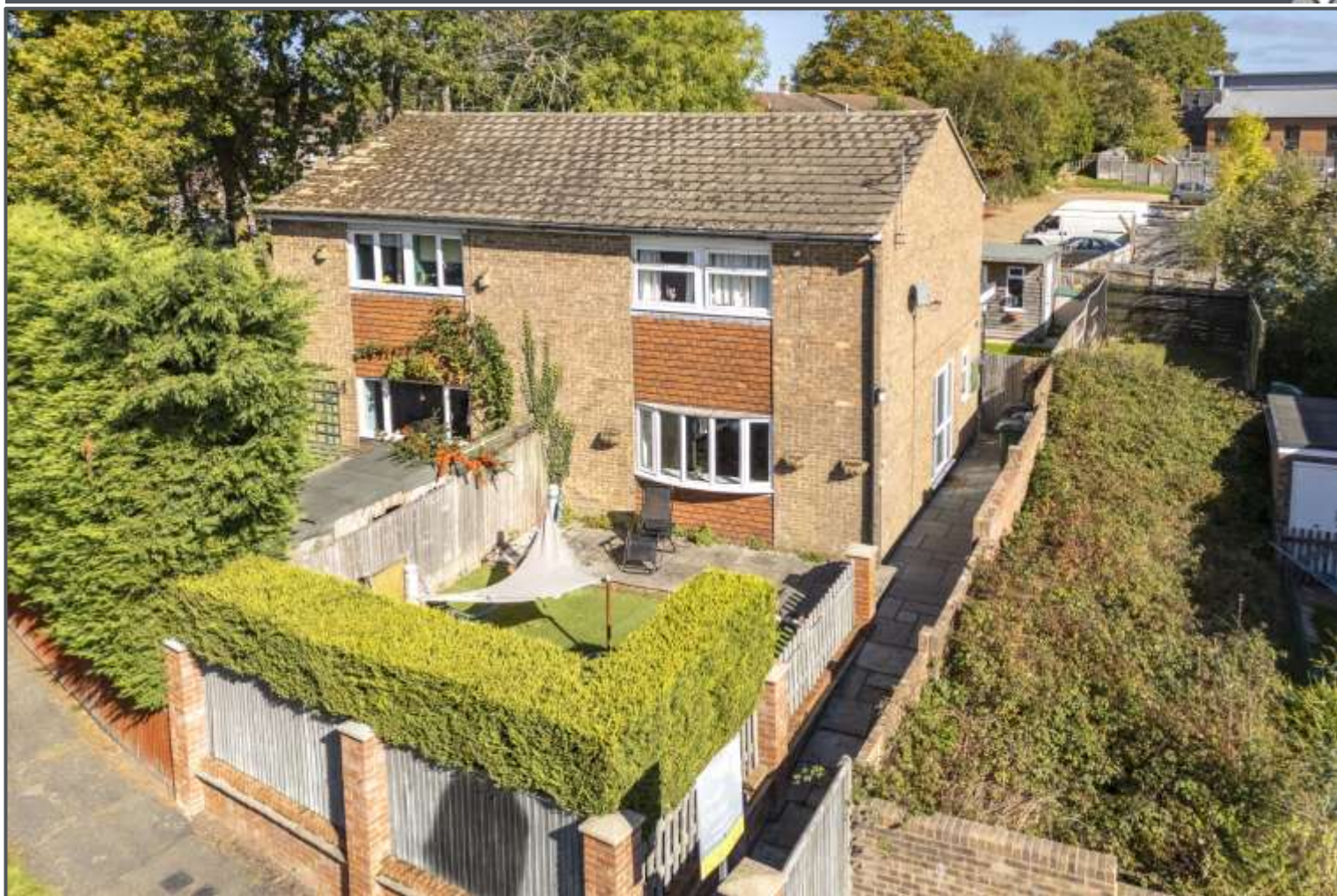
Campbell Close, Uckfield, TN22 1DR