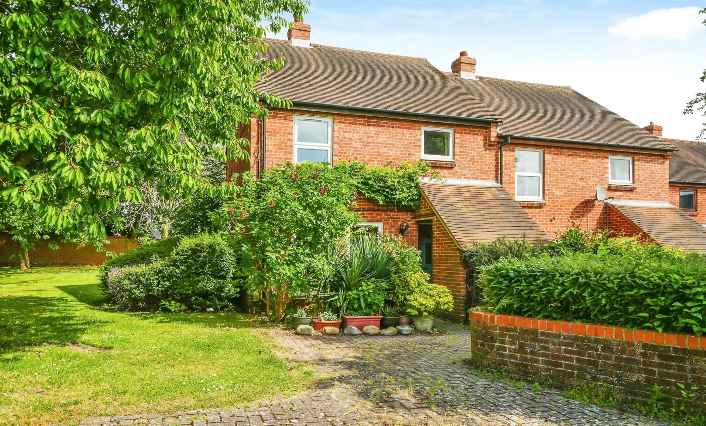
Sayers Orchard, Didcot, OX11 7BA