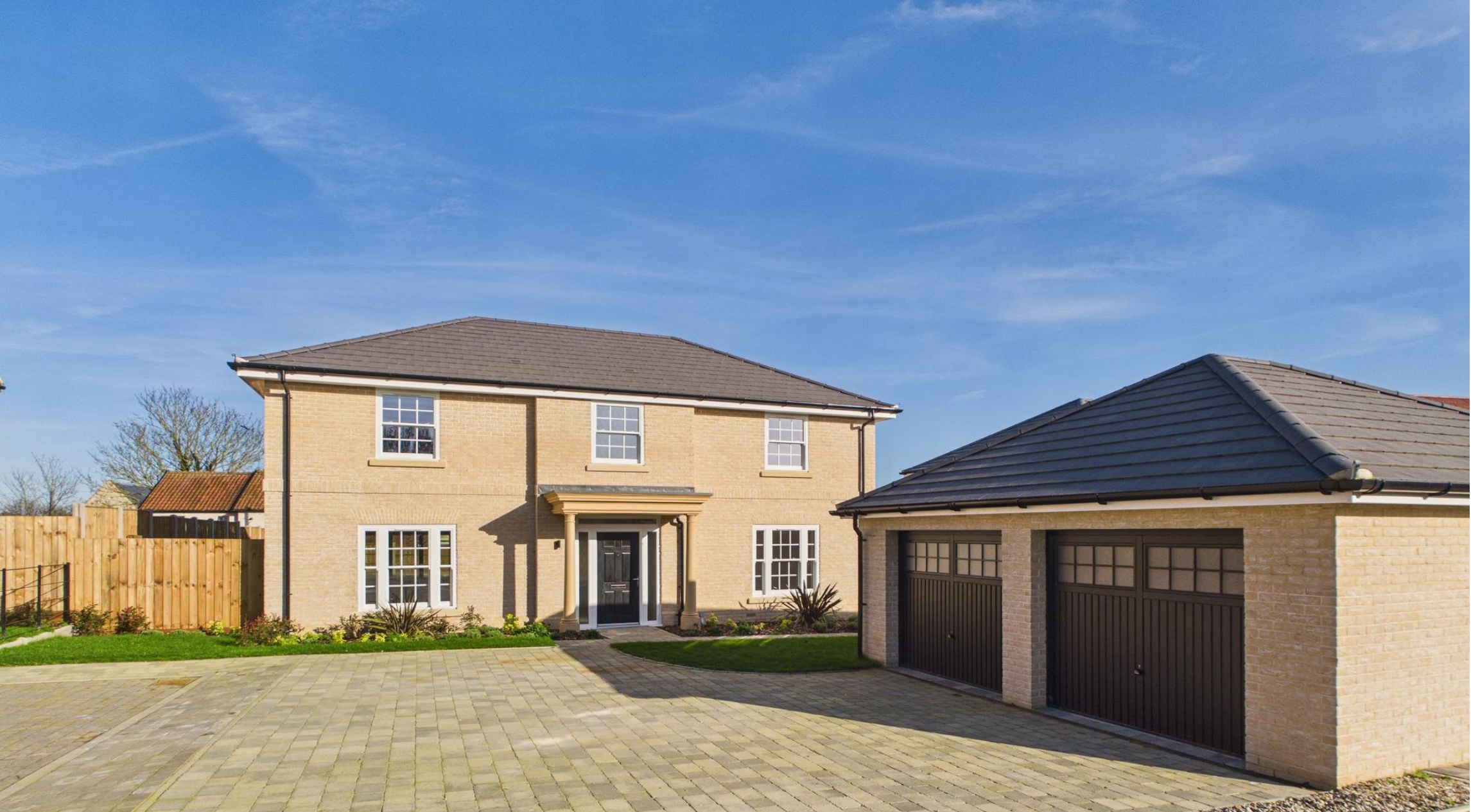
Croft House, Framlingham, Suffolk