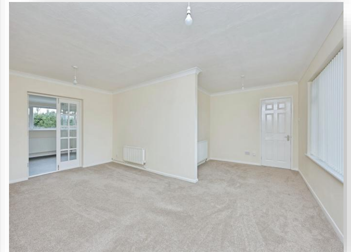
Nelson Court, Watton Thetford IP25 6EL