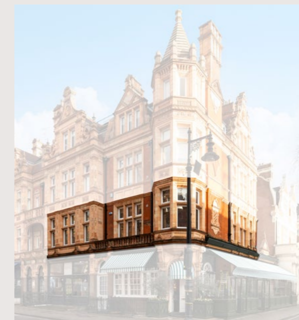
Highlight of apartment's position in the building

The two bedroom suites are luxurious with wonderful built-in wardrobe space and both have a separate dressing room. The principal bedroom suite is simply stunning, with a light and delicate feel created by Australian crystal white stone. The second en-suite is just as impressive having been finished in bleu-de-sovoie marble. The apartment further benefits from air conditioning, underfloor heating, and Crestron automation throughout.