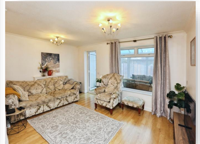
Vian Close, Gosport PO13 0TX