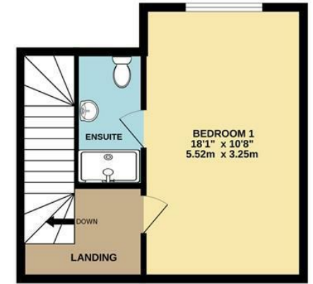
2ND FLOOR 317 sq.ft. (29.5 sq.m.) approx.