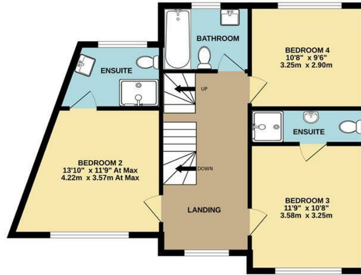
1ST FLOOR 637 sq.ft. (59.1 sq.m.) approx.