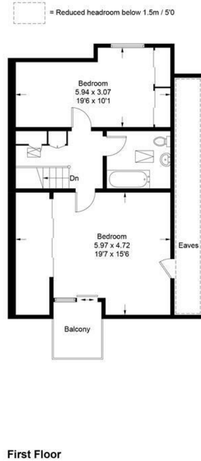
Illustration for identification purposes only, measurements are approximate, not to scale. Fourlabs.co © (ID1306394)