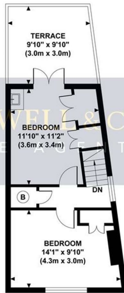
FRIST FLOOR GROSS INTERNAL FLOOR AREA 315 SQ FT