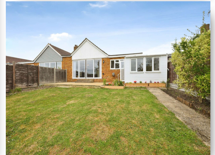
Banes Down, Nazeing Waltham Abbey EN9 2NU