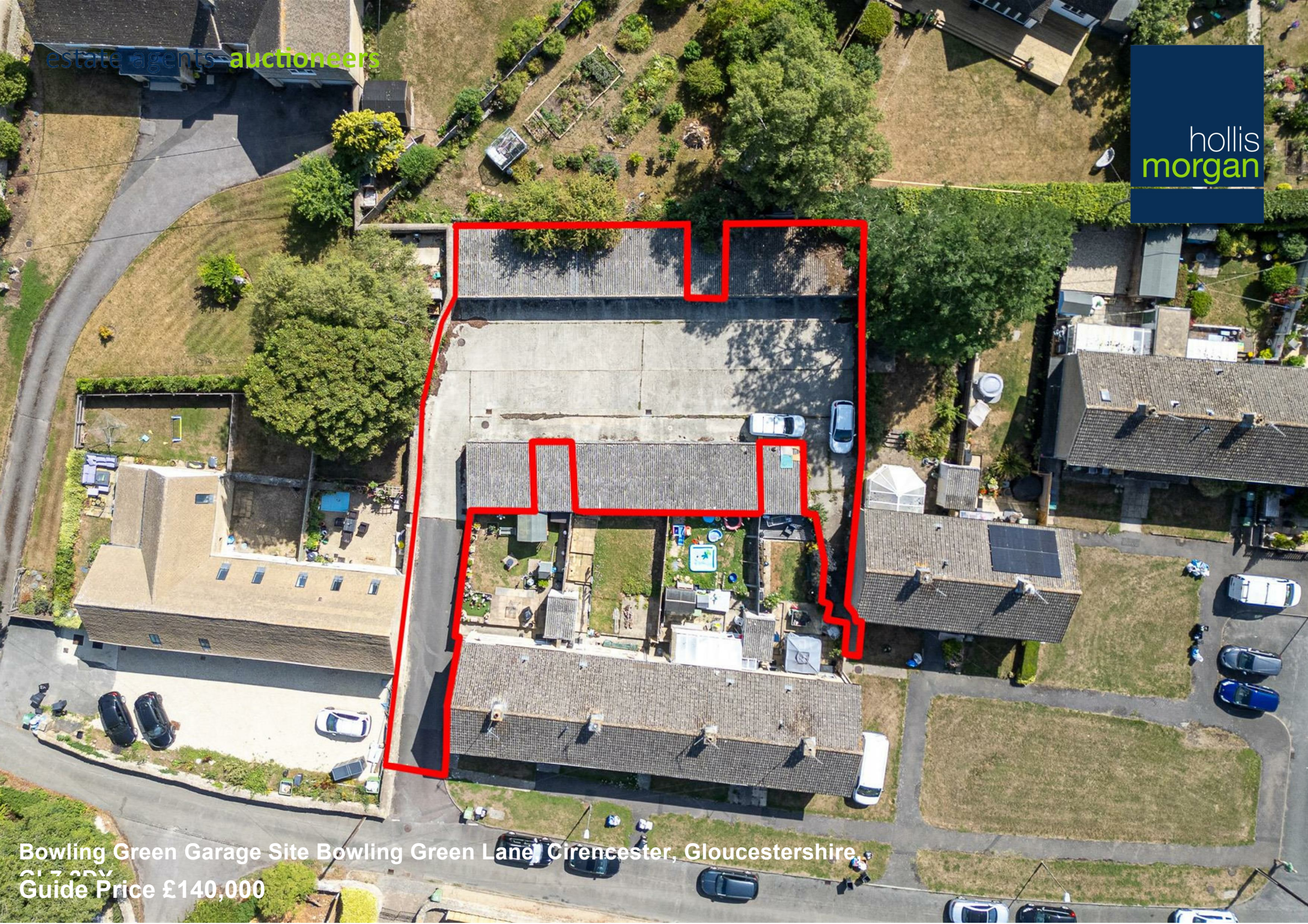
Bowling Green Garage Site Bowling Green Lane, Cirencester, Gloucestershire GL7 2DY Guide Price £140,000