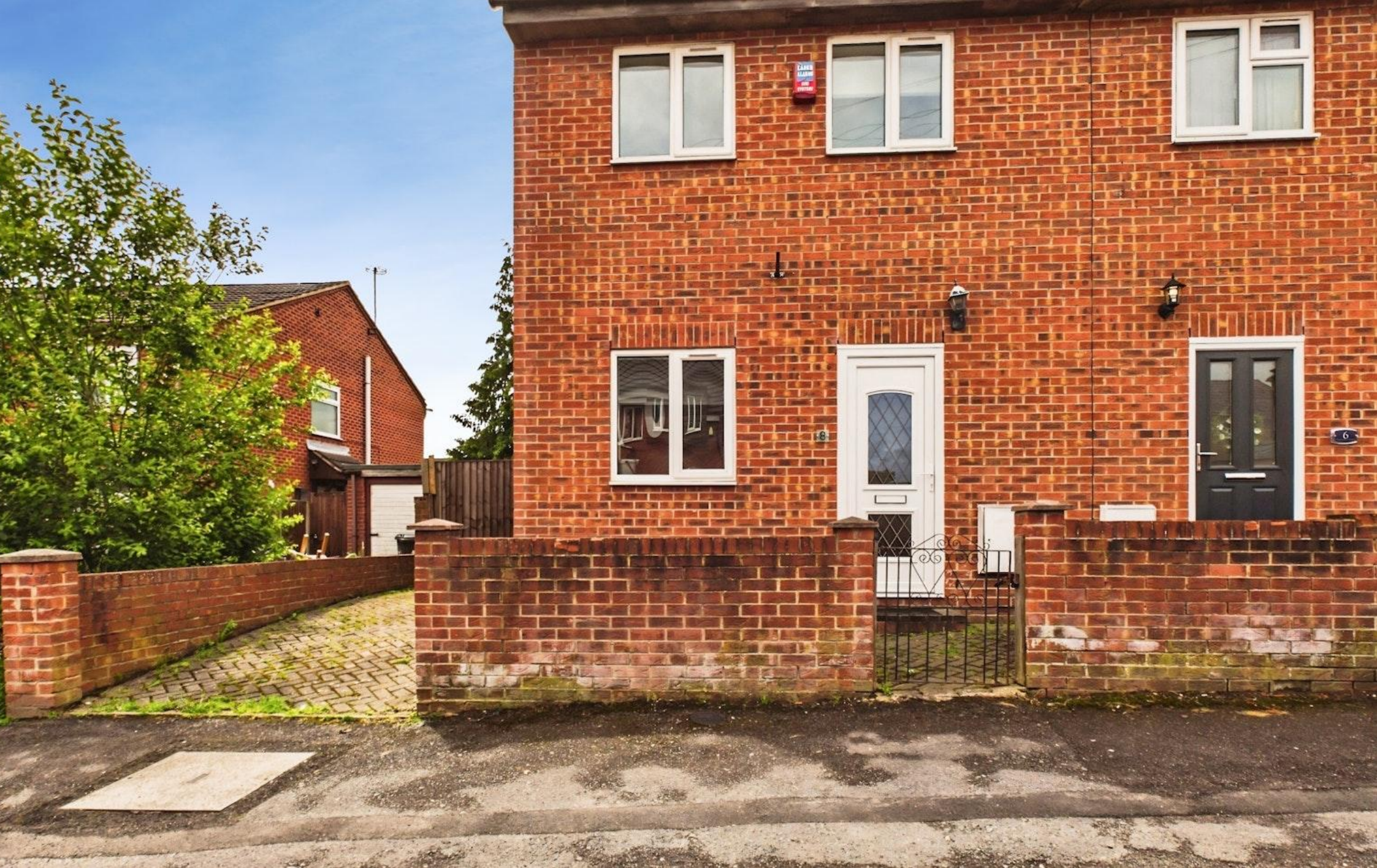
Stratford Street, Ilkeston, Derby