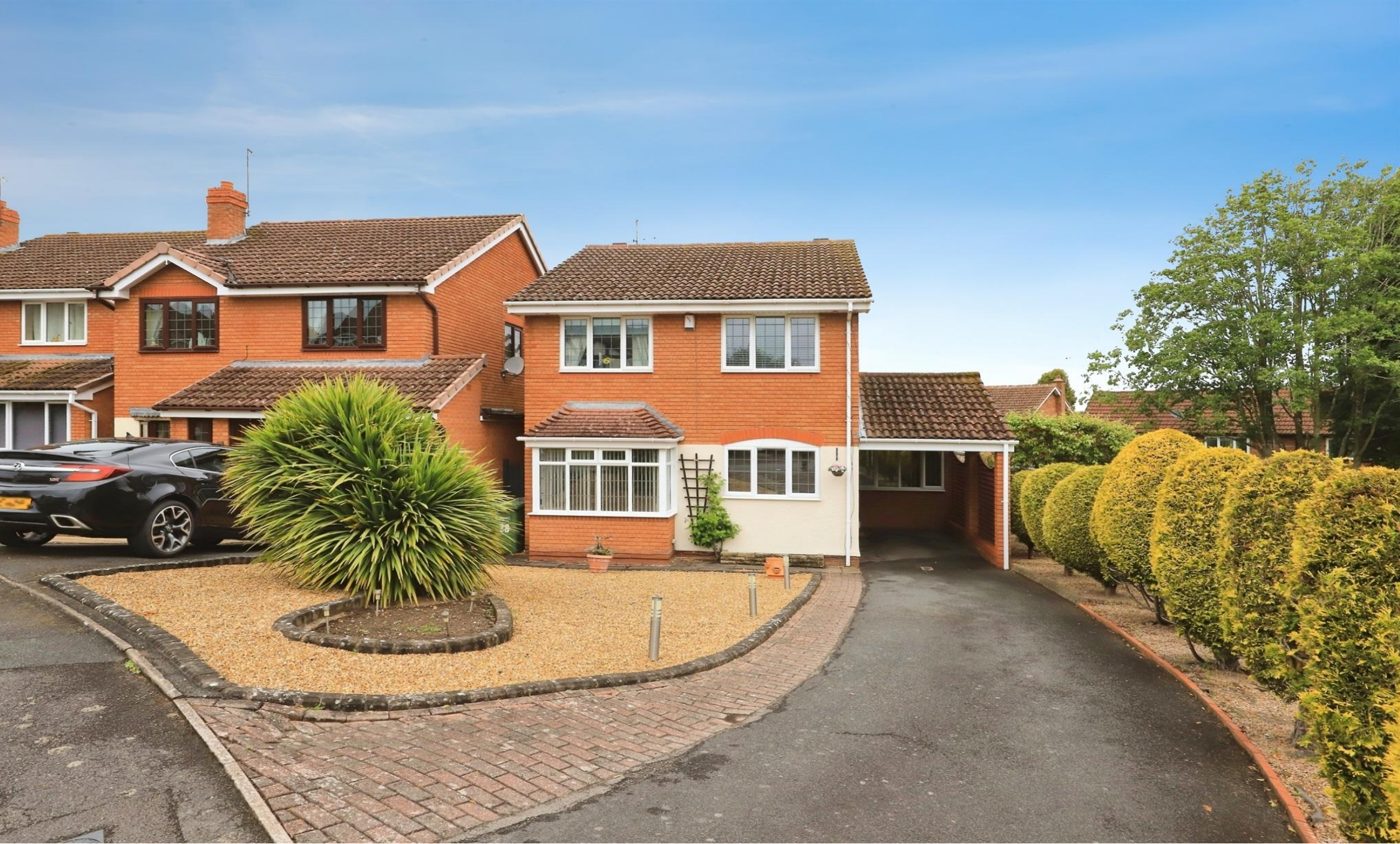
Serin Close, Kidderminster DY10 4TY

Not for marketing purposes. INTERNAL USE ONLY