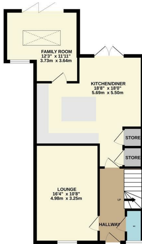
GROUND FLOOR 659 sq.ft. (61.2 sq.m.) approx.