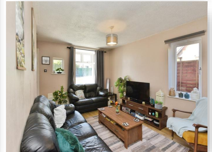
Redwood Gate, Shenley Lodge Milton Keynes MK5 7BZ