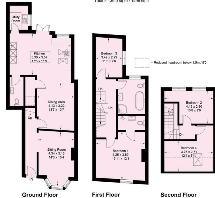
illustration for identification purposes only. measurements are approximate, not to scale Pursuant to RICS Property Measurement 2nd Edition © Intelligent Property Marketing 2026