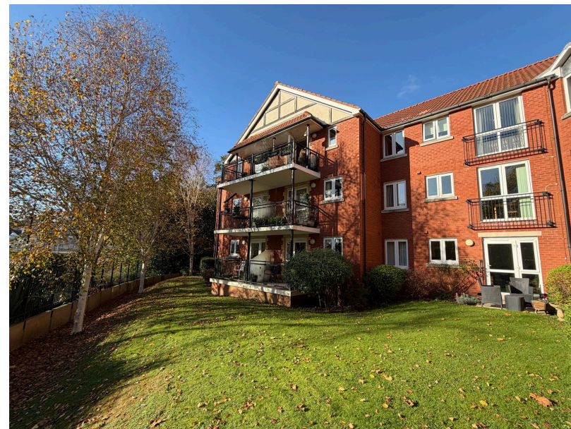
Top Floor Apartment

A very well presented Purpose Built Two Bedroomed top floor sheltered apartment situated in a level location looking towards Victoria Park. Walking distance of Paignton Town Centre, Sea Front and Beach. The apartment features good sized living accommodation including Lounge/Dining room, separate fitted Kitchen, two Bedrooms one with built-in wardrobes, and a Shower room. Communal facilities include residents Lounge, Guest Suite, well maintained communal Gardens and Laundry room. Communal Parking on a first come first served basis. No Chain. Internal Viewing is recommended.