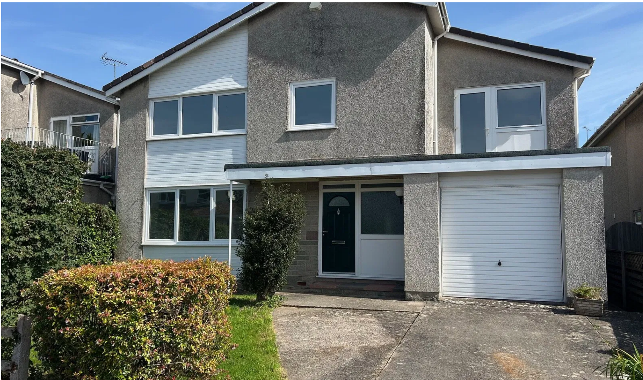
The Grove, Winscombe £535,000