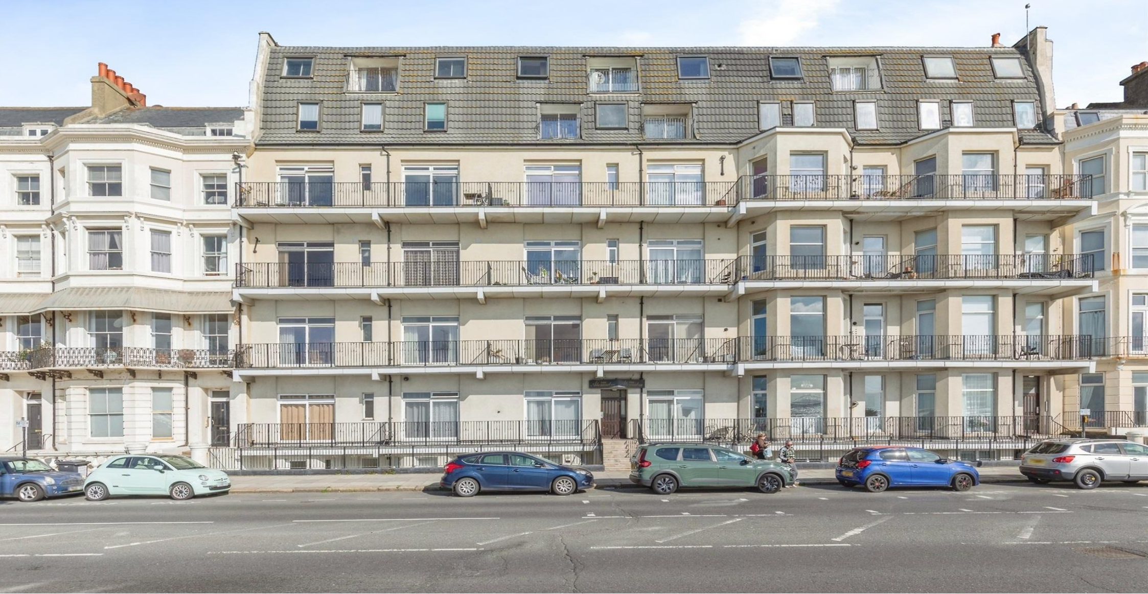
The Alexandra - Eversfield Place, St. Leonards-On-Sea TN37 6QP