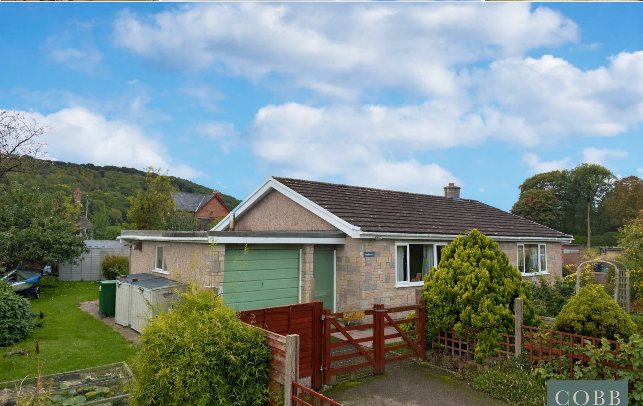
Sandibrook, Walton, LD8 2PU Price £320,000