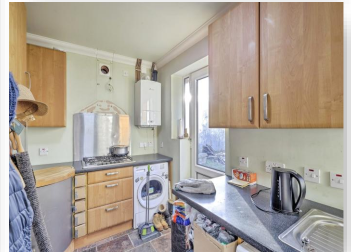
Lindale Close, Northampton NN3 2AQ