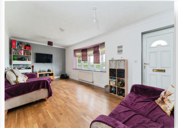
Helens Farm, Meadow Lane, Ramsey PE26 2QL