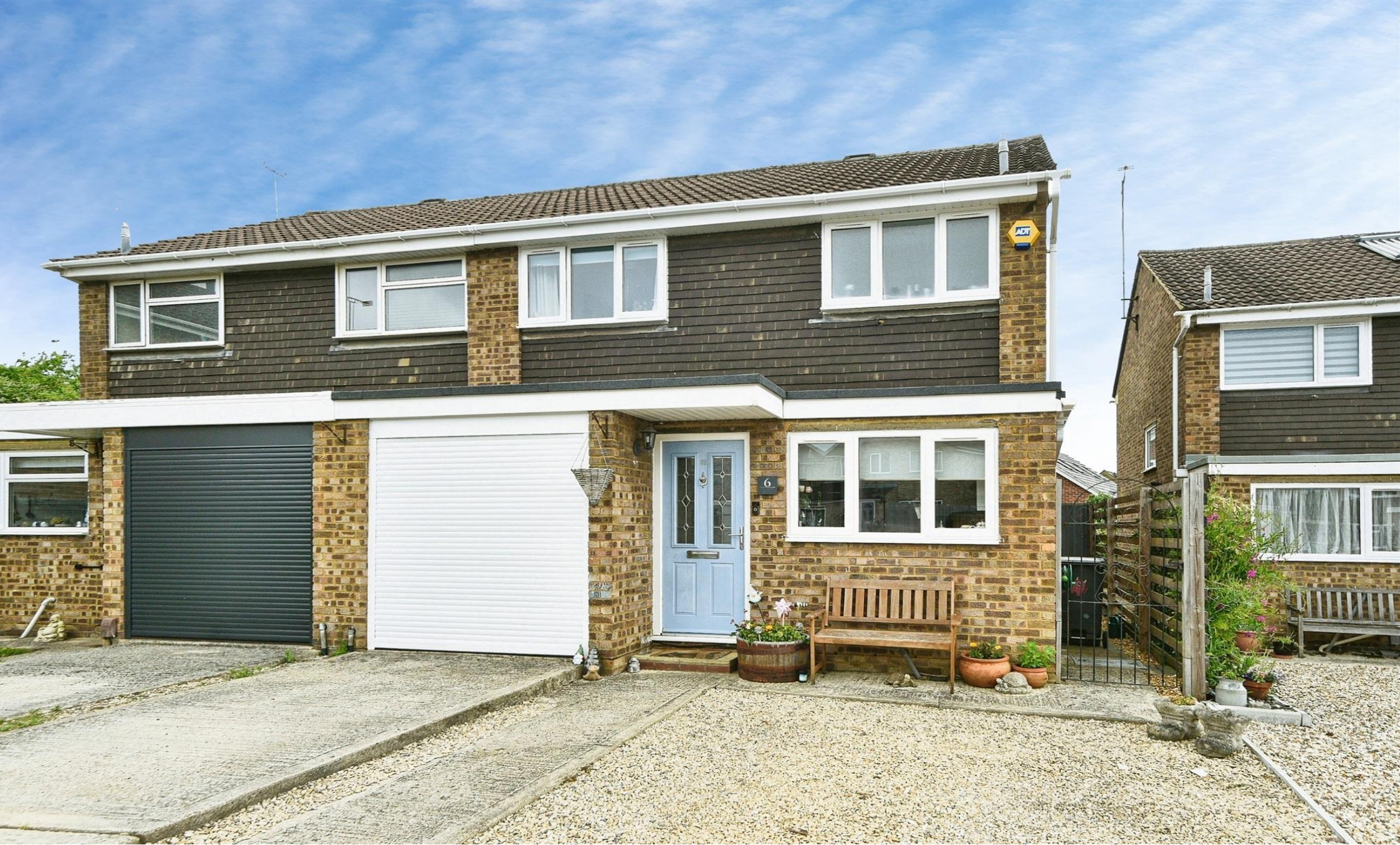
Harrow Close, Swindon SN3 4QD