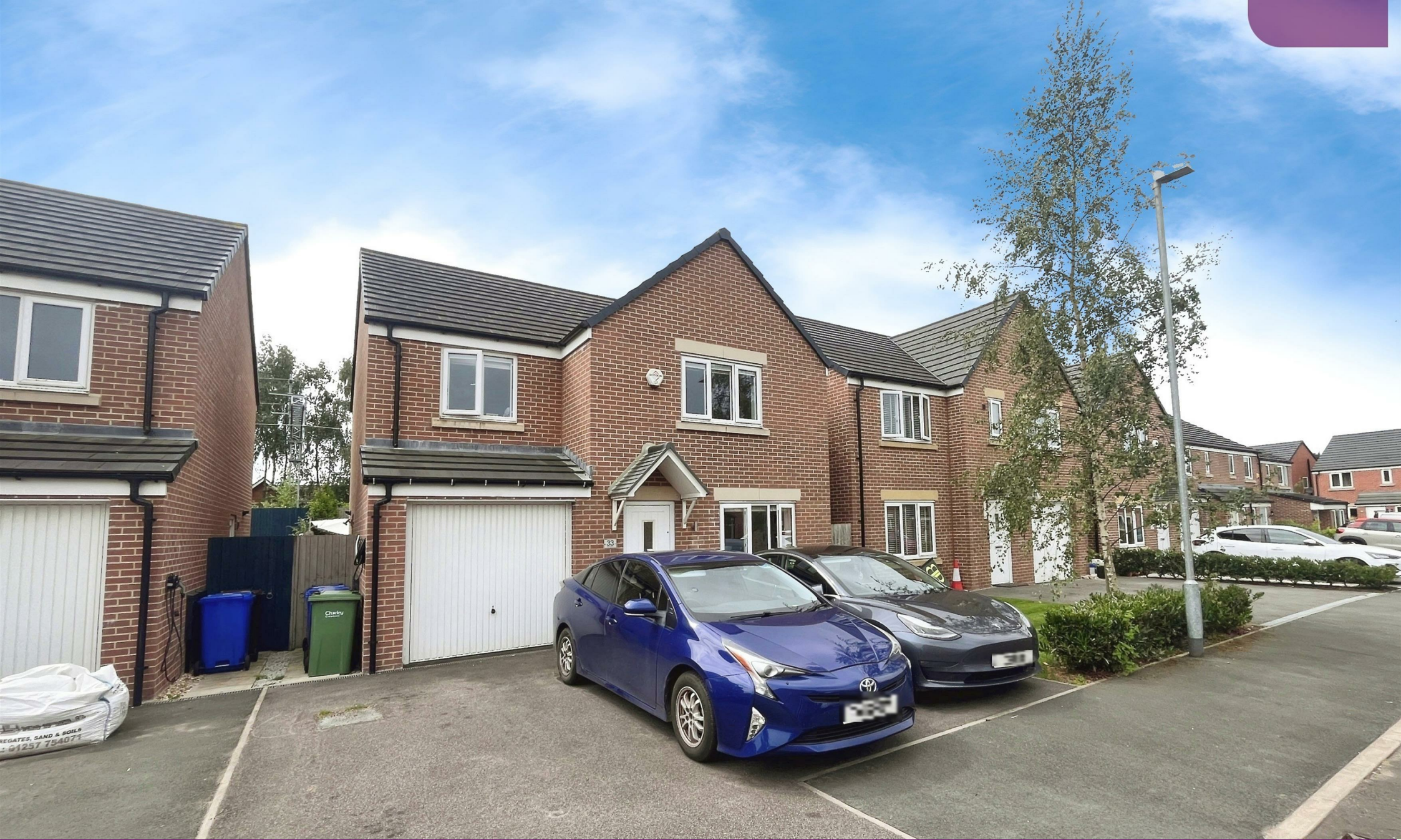
33 Stirling Drive, Buckshaw Village, PR7 7LS £293,995