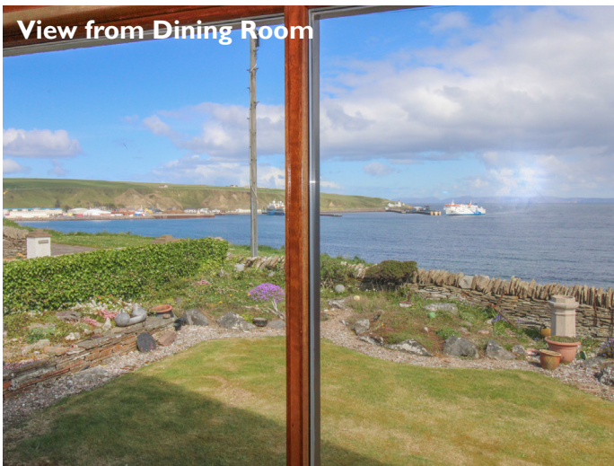
View from Dining Room