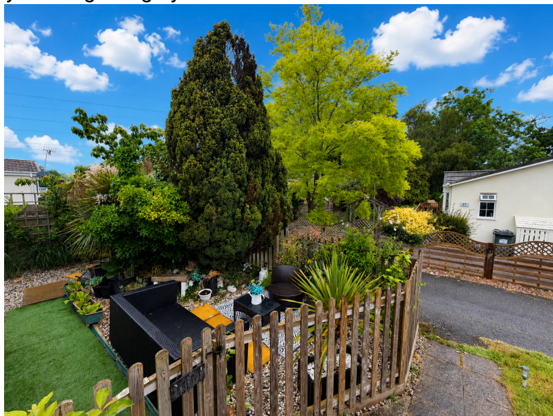
24 Ganders Park