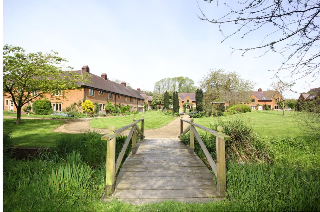
Manor Court Gardens