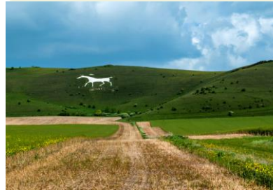
White Horse Hill