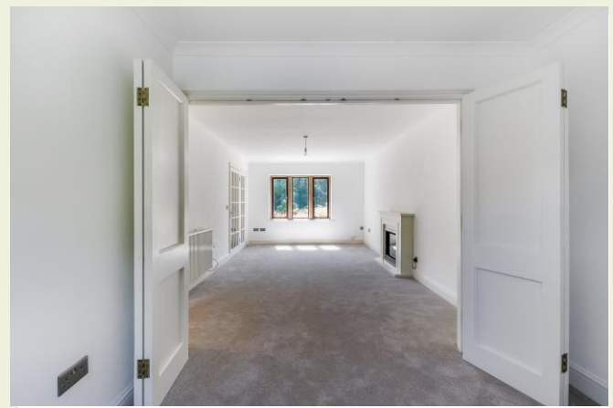
Dining Room through to Sitting Room