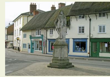
Pewsey High Street