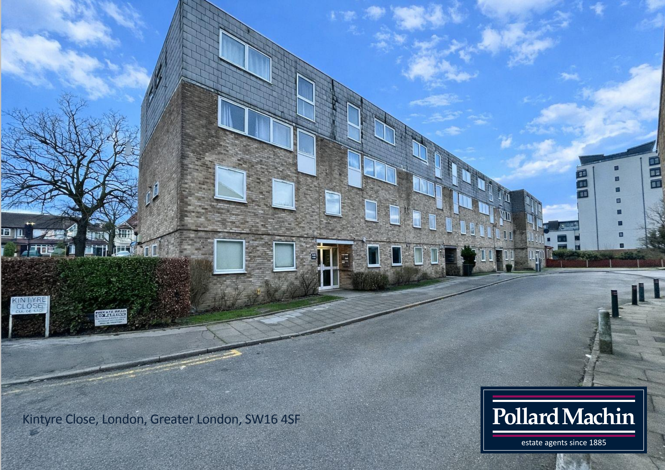
Kintyre Close, London, Greater London, SW16 4SF