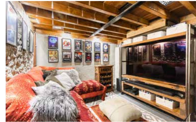
The property's cinema room

“...a unique blend of historical character and modern convenience.”