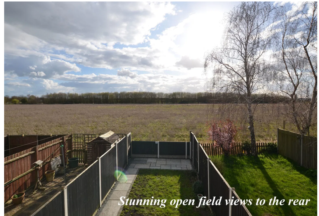
Stunning open field views to the rear