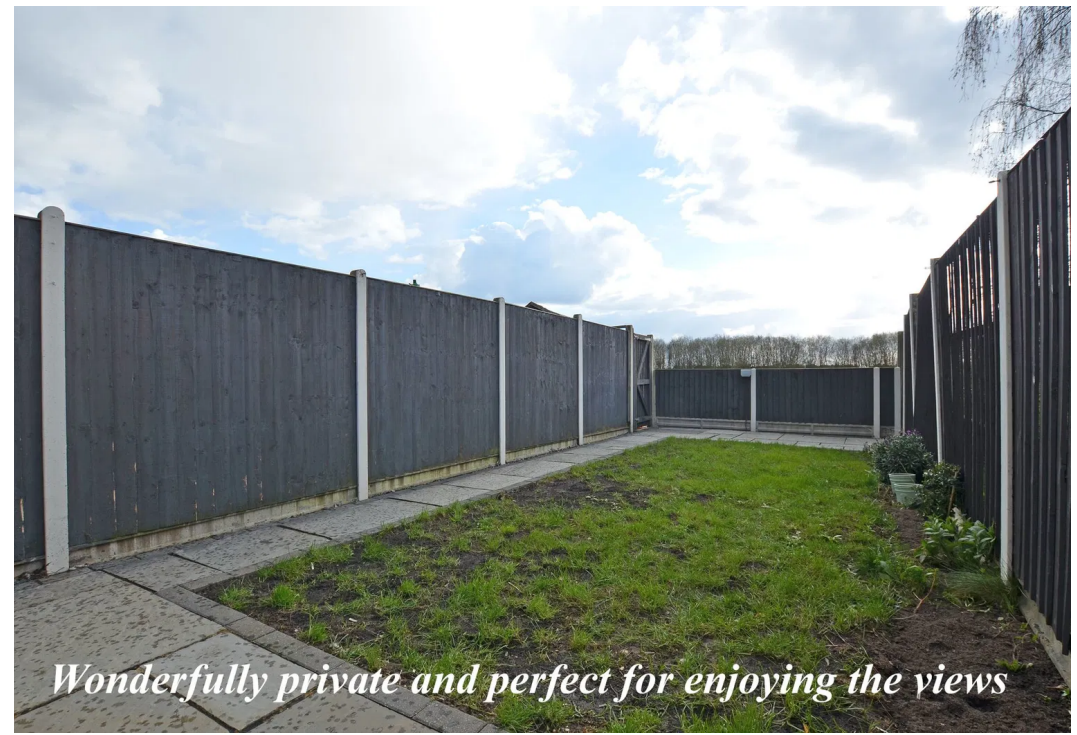
Wonderfully private and perfect for enjoying the views