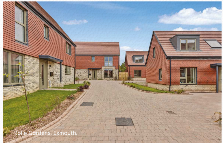
Rolle Gardens, Exmouth.

Write the NEXT CHAPTER of YOUR STORY with us