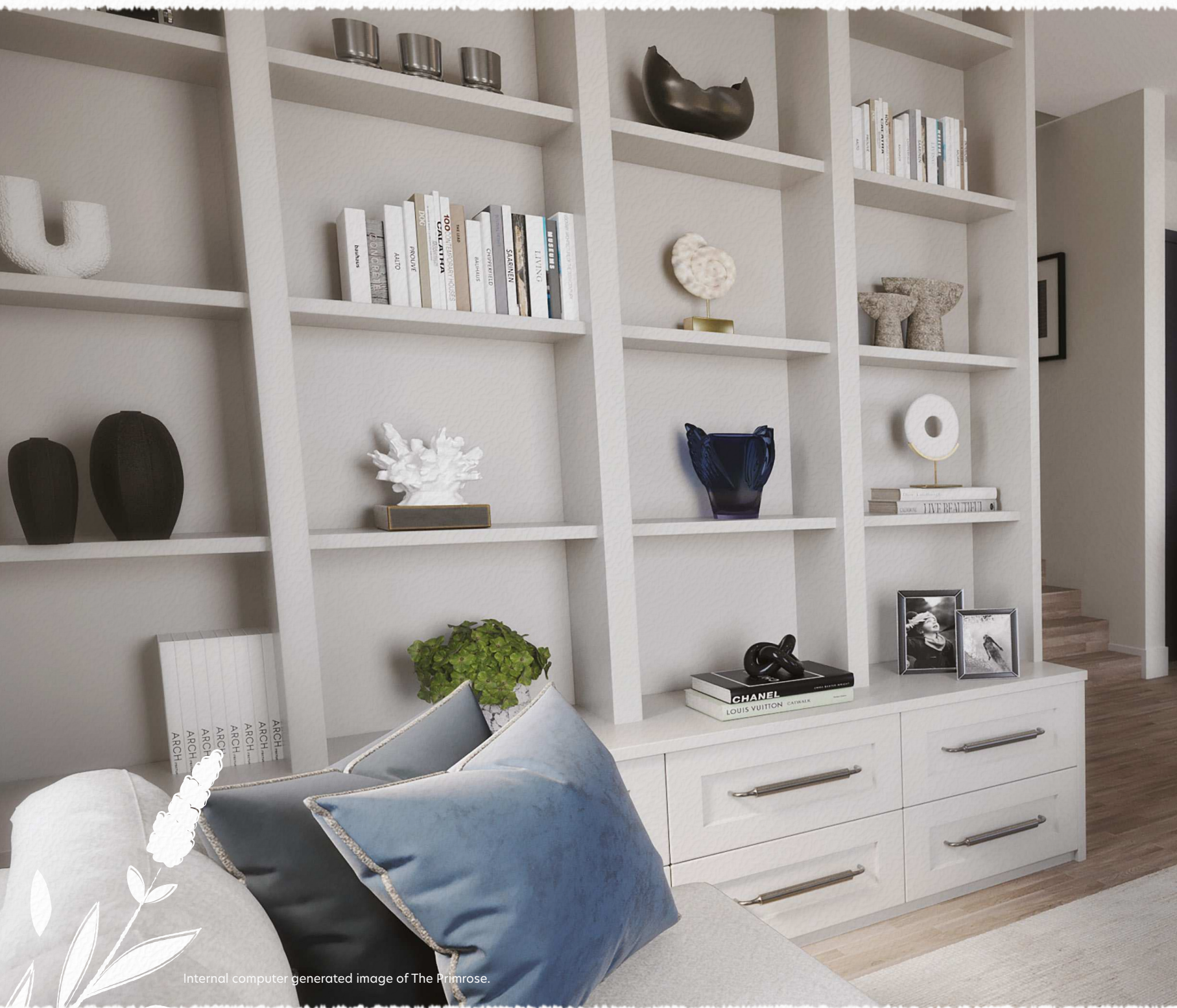
Internal computer generated image of The Primrose.