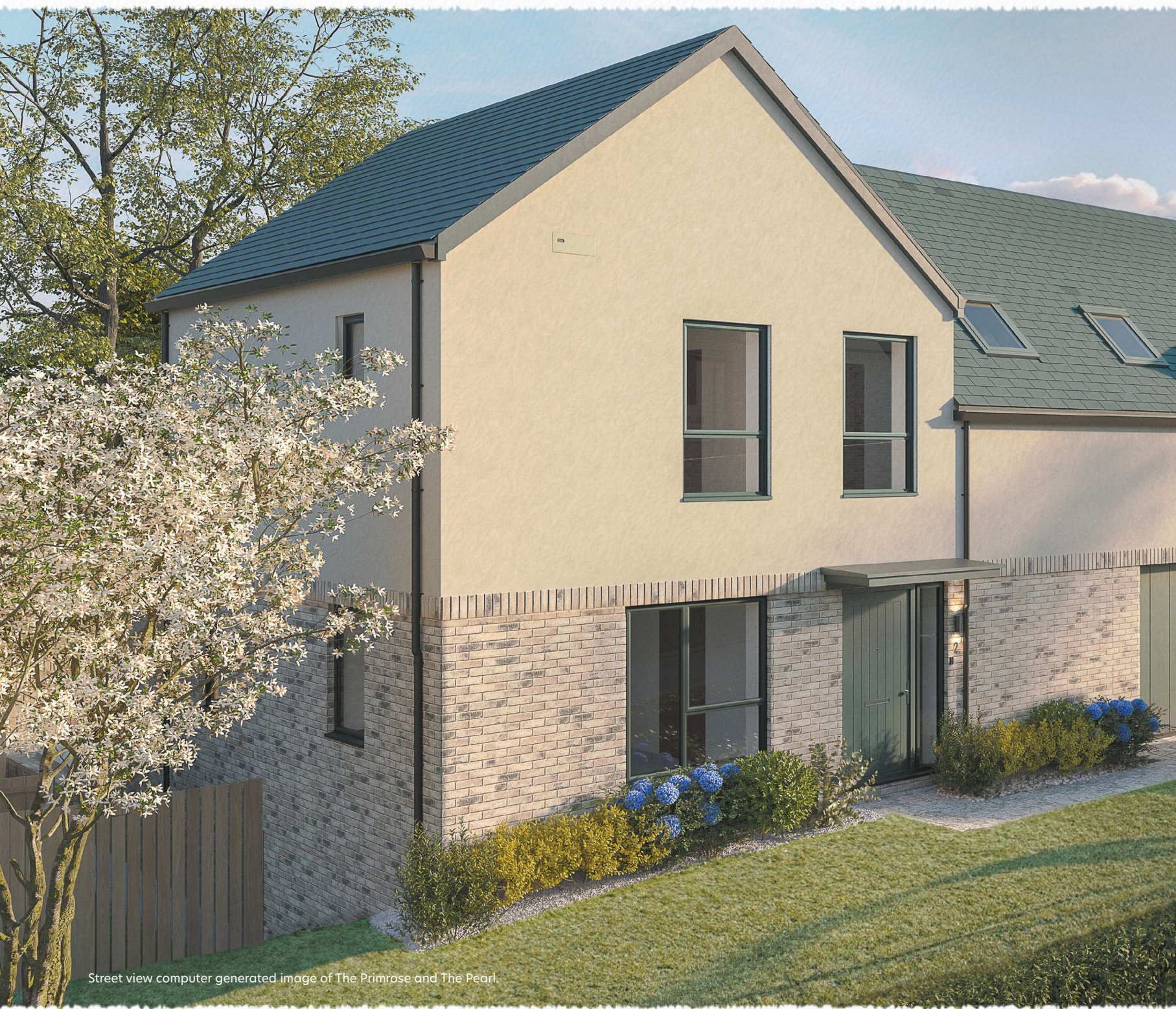
Street view computer generated image of The Primrose and The Pearl.