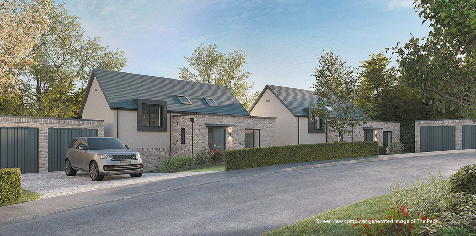
Street view computer generated image of The Pearl.