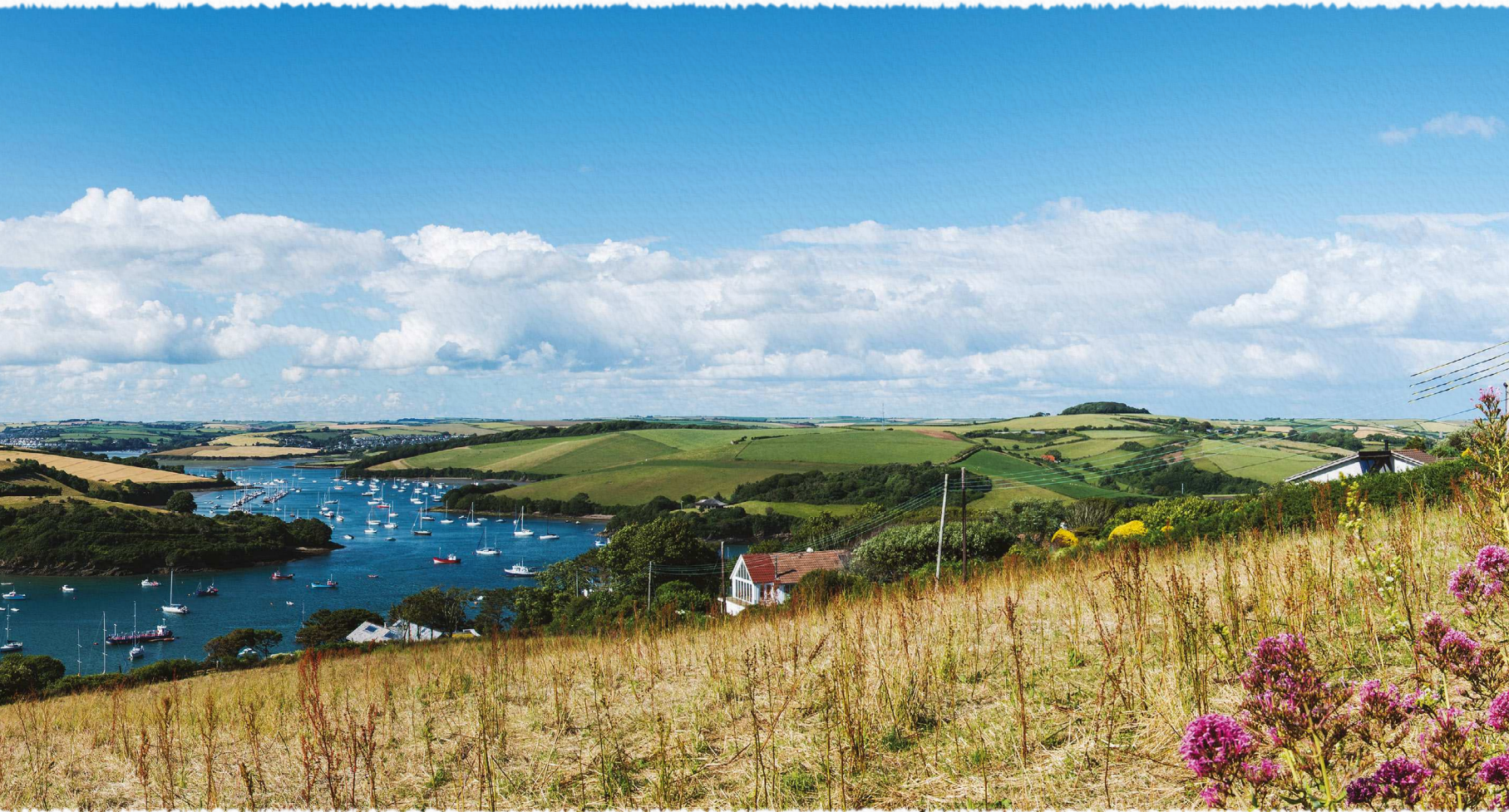
Salcombe and East Portlemouth