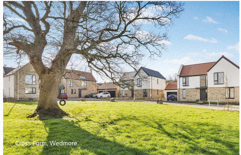
Cross Farm, Wedmore.

Previous developments by Acorn Property Group