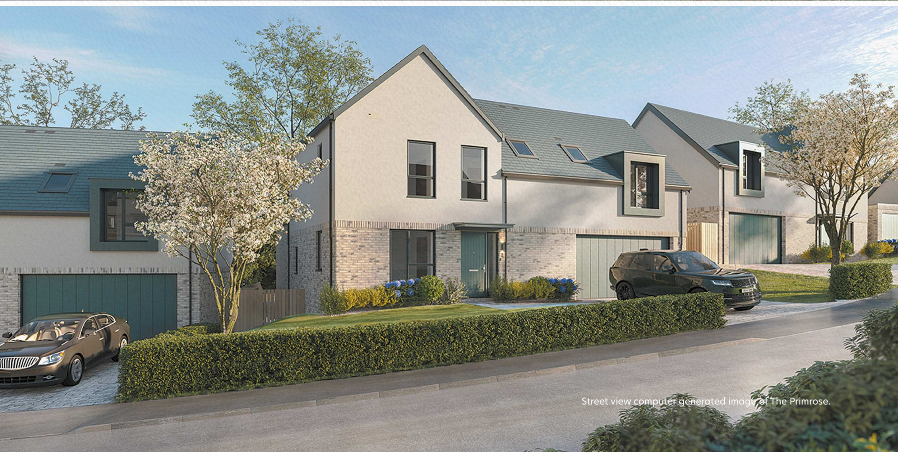
Street view computer generated image of The Primrose.