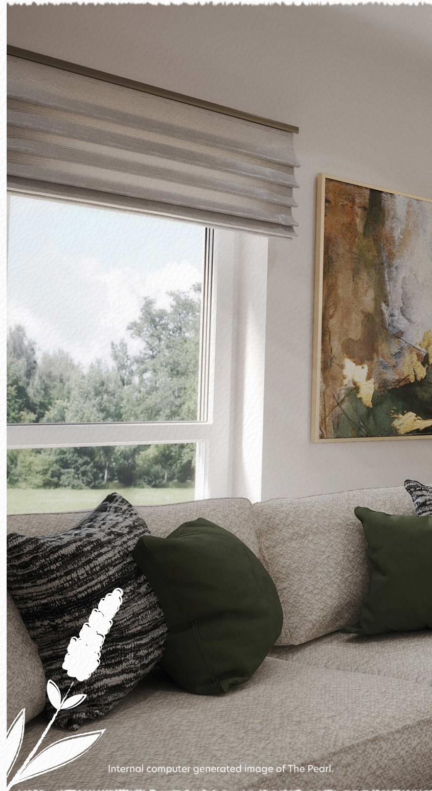
Internal computer generated image of The Pearl.

The front of each home offers convenient parking with a garage and additional off-street parking.