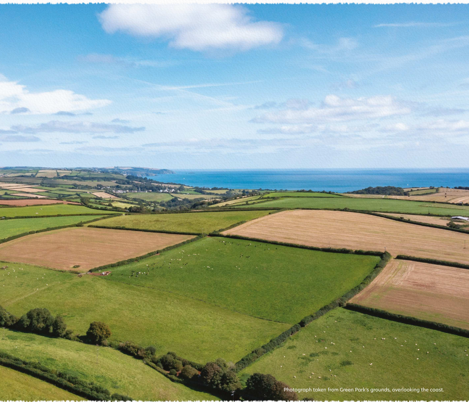
Photograph taken from Green Park's grounds, overlooking the coast.