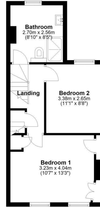
First Floor Approx. 36.6 sq. metres (393.7 sq. feet)