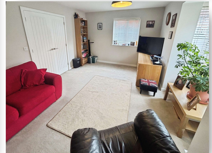
Daffodil Way, Red Lodge, Bury St. Edmunds, IP28 8YW