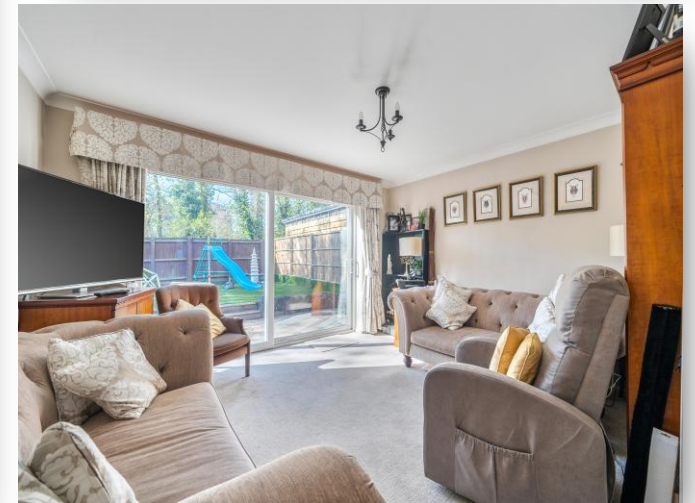
7 Firs Lane, Maidenhead SL6 3PG