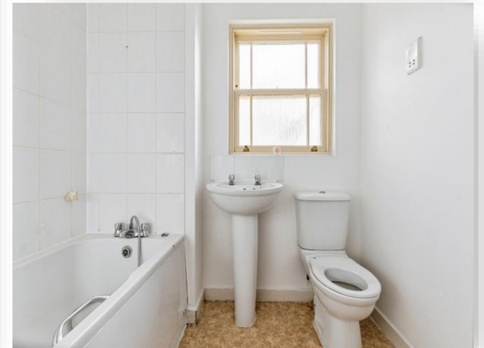
Chapman Road, Wellingborough NN8 1JN