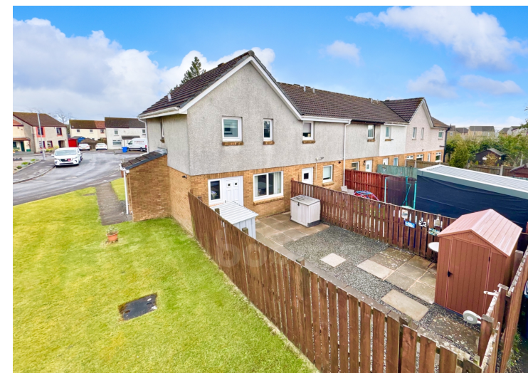
Maxwell Court, Beith