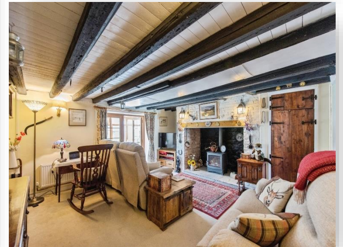
Poppy Cottage, Northwold Thetford IP26 5LS