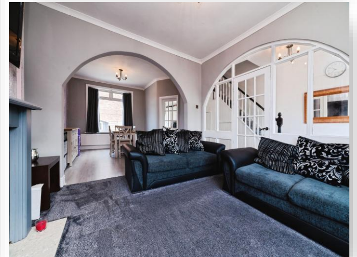
Hessle Road, Hull HU4 7AL