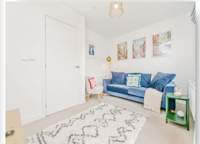
Maes Yr Ysgol, Rumney Cardiff CF3 3NL