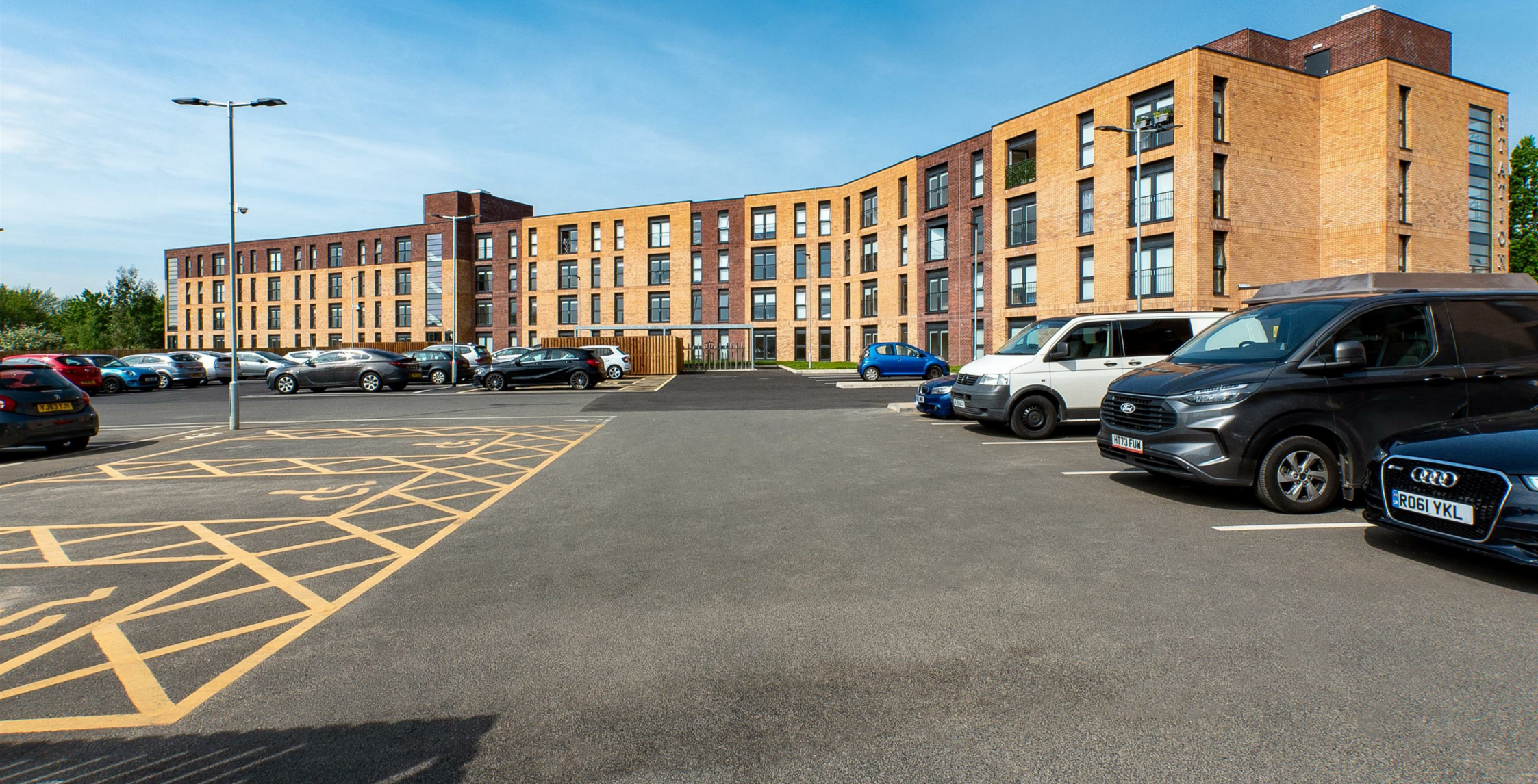
100 Station Quarter, Hunslet House Corby, NN17 1GA