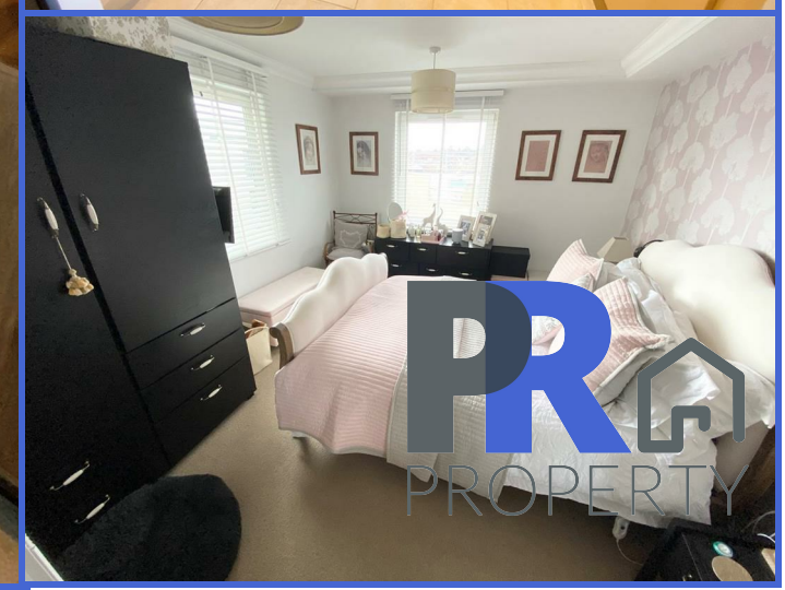
Flat 76, Hatton Place Midland Road, Luton, LU2 0FD £1,400 PCM