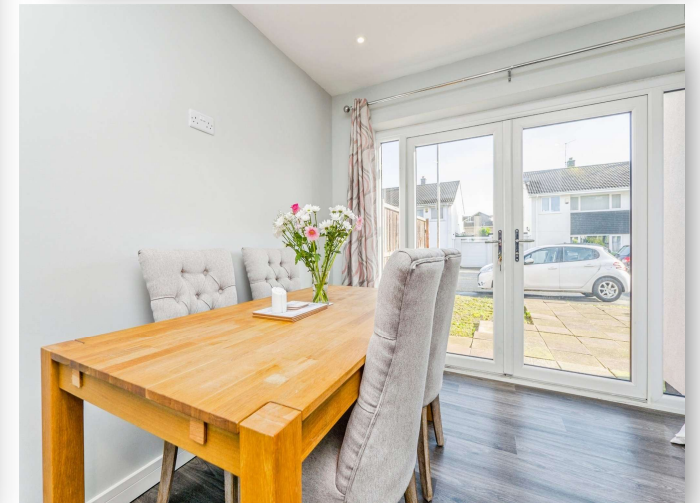
Ty To Maen Close, Old St. Mellons Cardiff CF3 5EZ