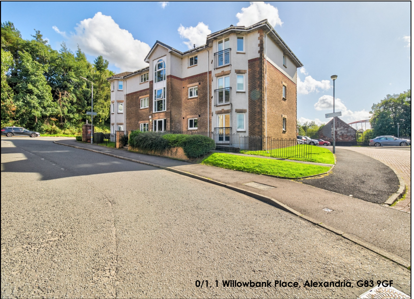
0/1, 1 Willowbank Place, Alexandria, G83 9GF

David Muir Estate agents offer to the market this well-presented two-bedroom ground floor flat which sits within the much-admired Willowbank development, created by the well-respected builder, Turnberry Homes.