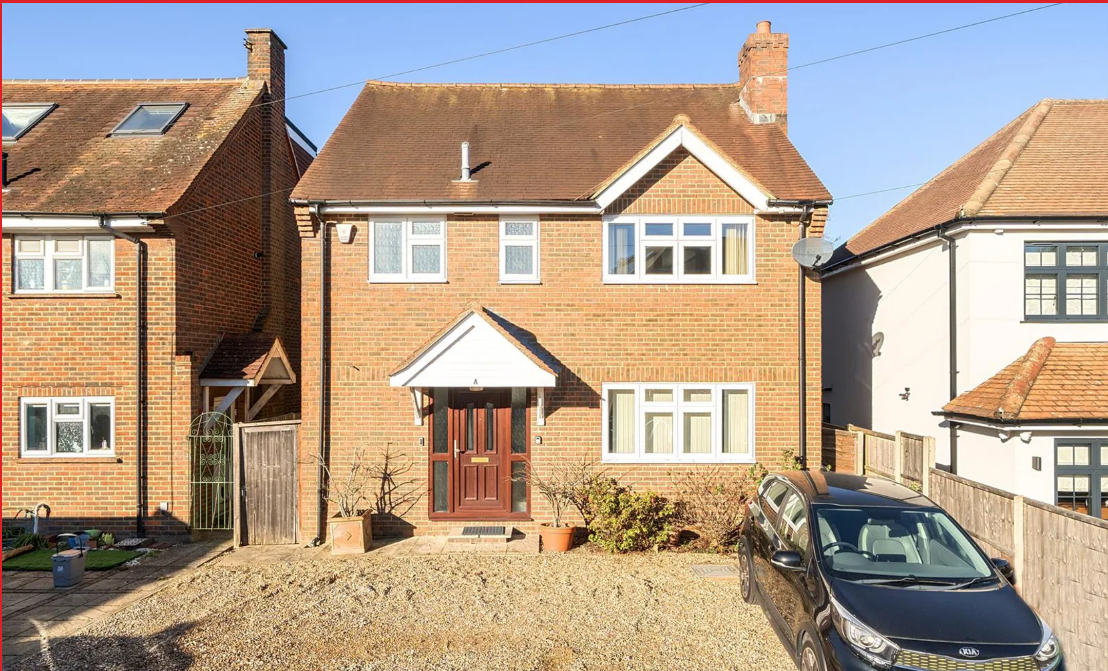
Orchard Close, Bushey Heath, Bushey Bushey