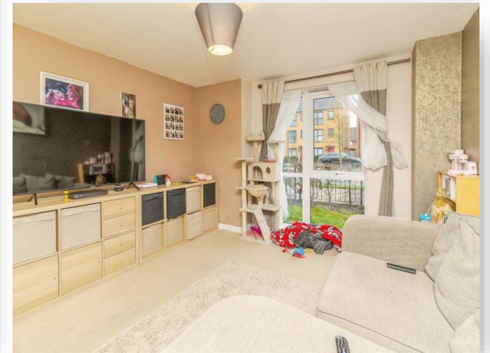
Countess Way, Brooklands, Milton Keynes, MK10 7HZ